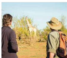
Game Drives & Walks