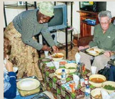
Home Hosted Meals