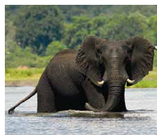
Chobe Day Trip