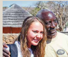
Meet the People Village Tour