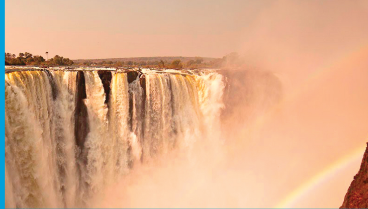
The Victoria Falls