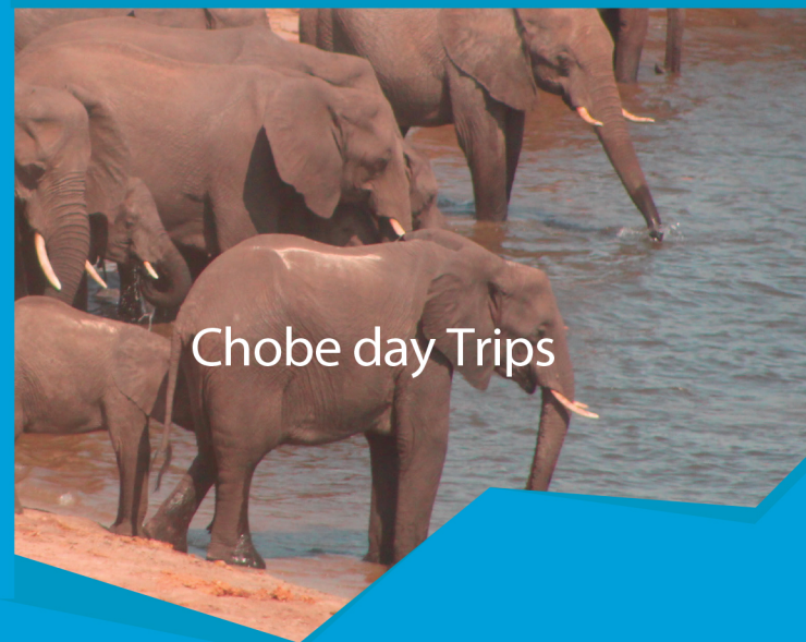
Chobe day Trips